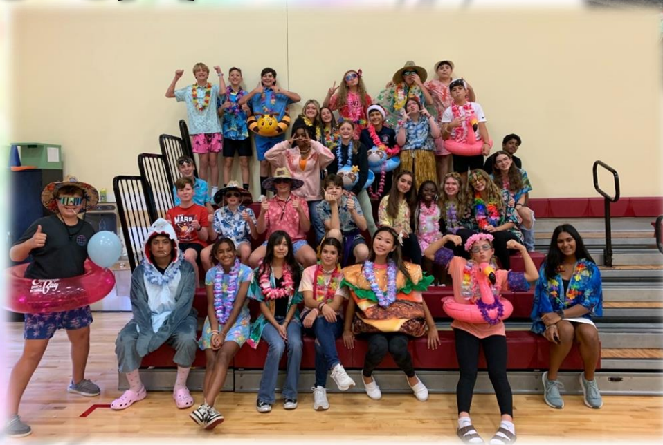
WEB crew 24-25