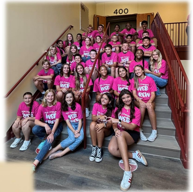
WEB crew 25-26